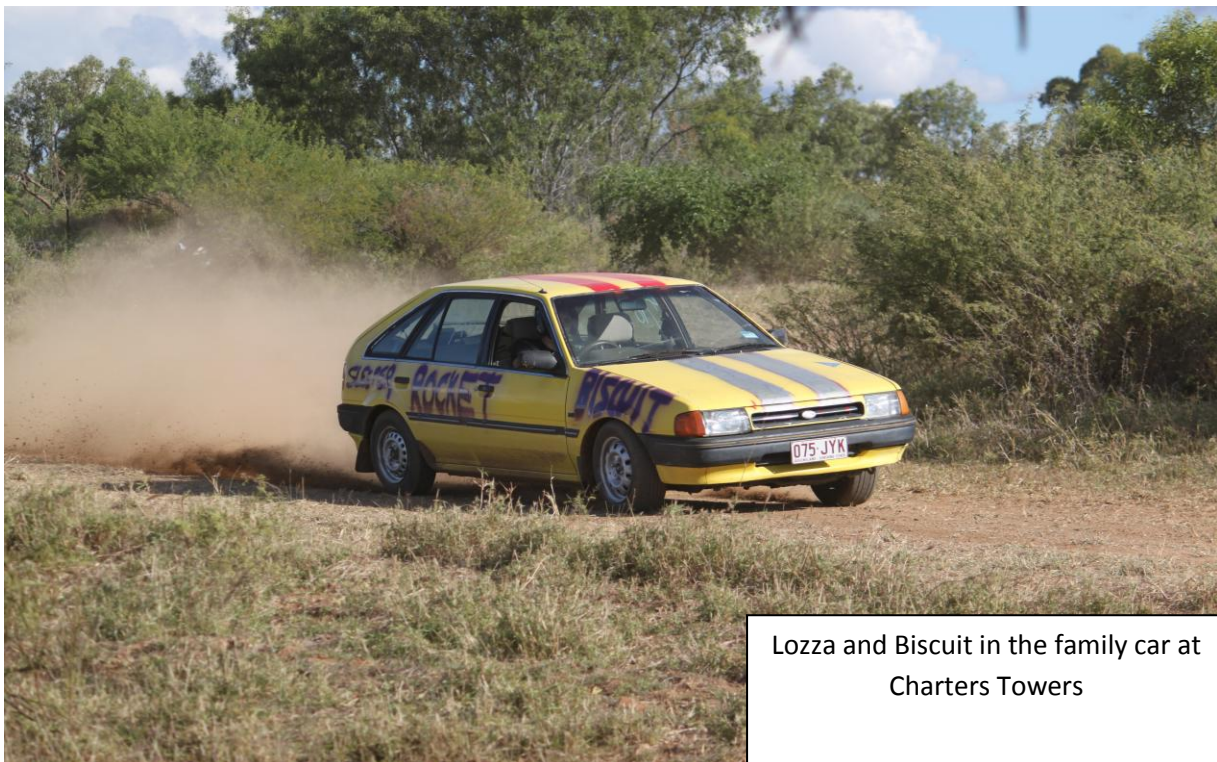
Lozza and Biscuit in the family car at Charters Towers